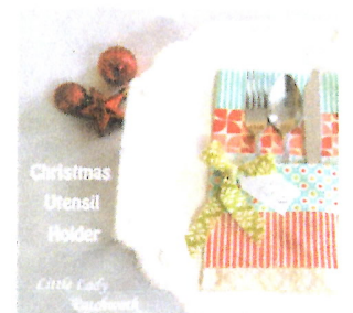
CHRISTMAS UTENSIL HOLDER (A TUTORIAL)